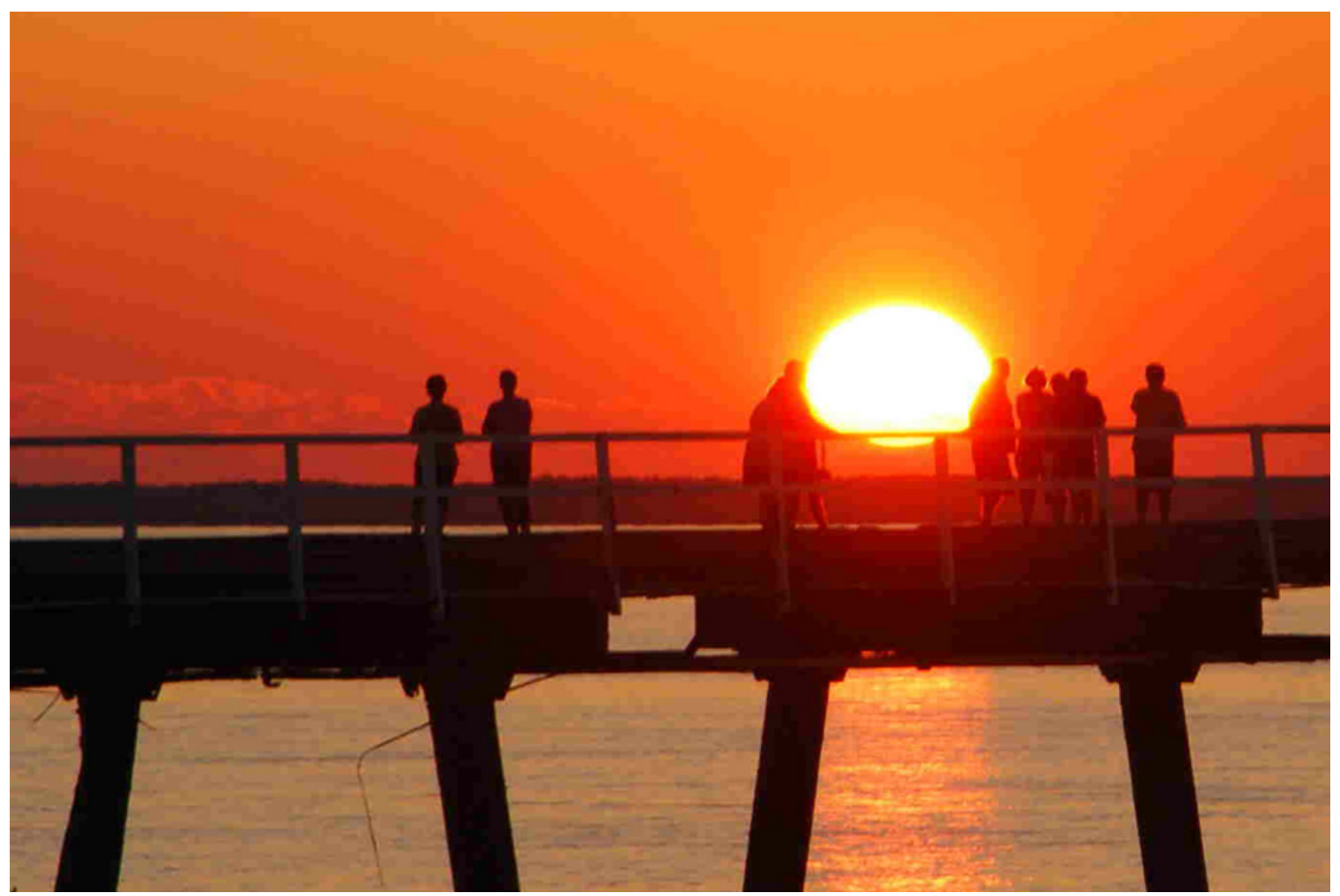
Strolling along the Derby Wharf in the Kimberley.