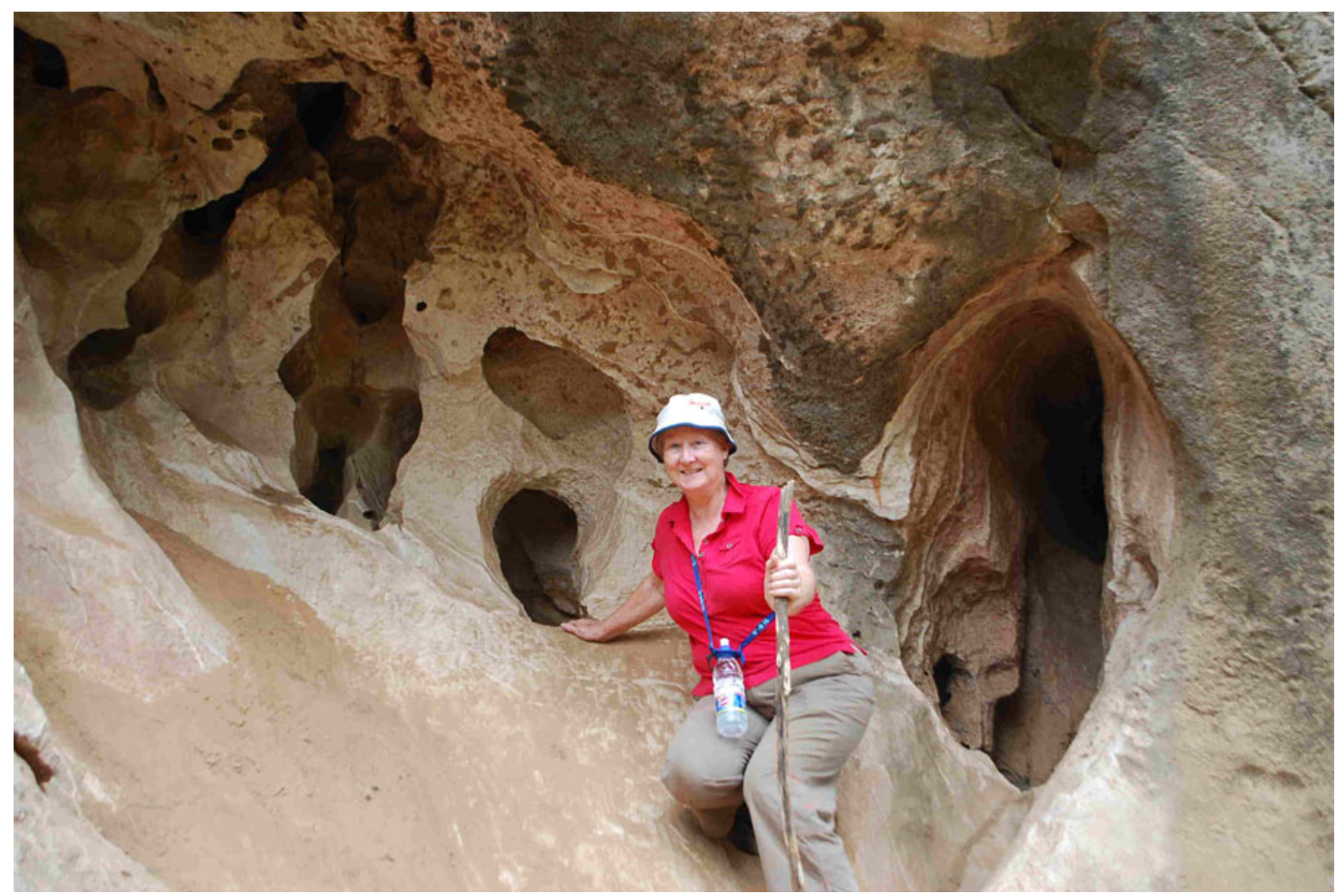
Windjana Gorge in the Kimberley.