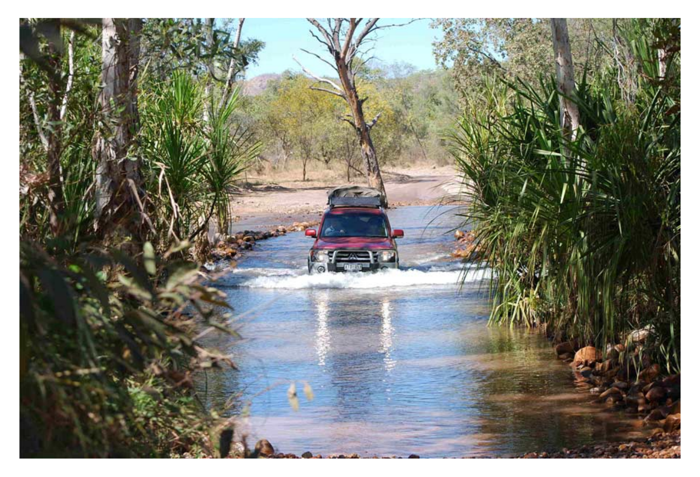
Make sure you prepare and bring everything you will need on the trip.