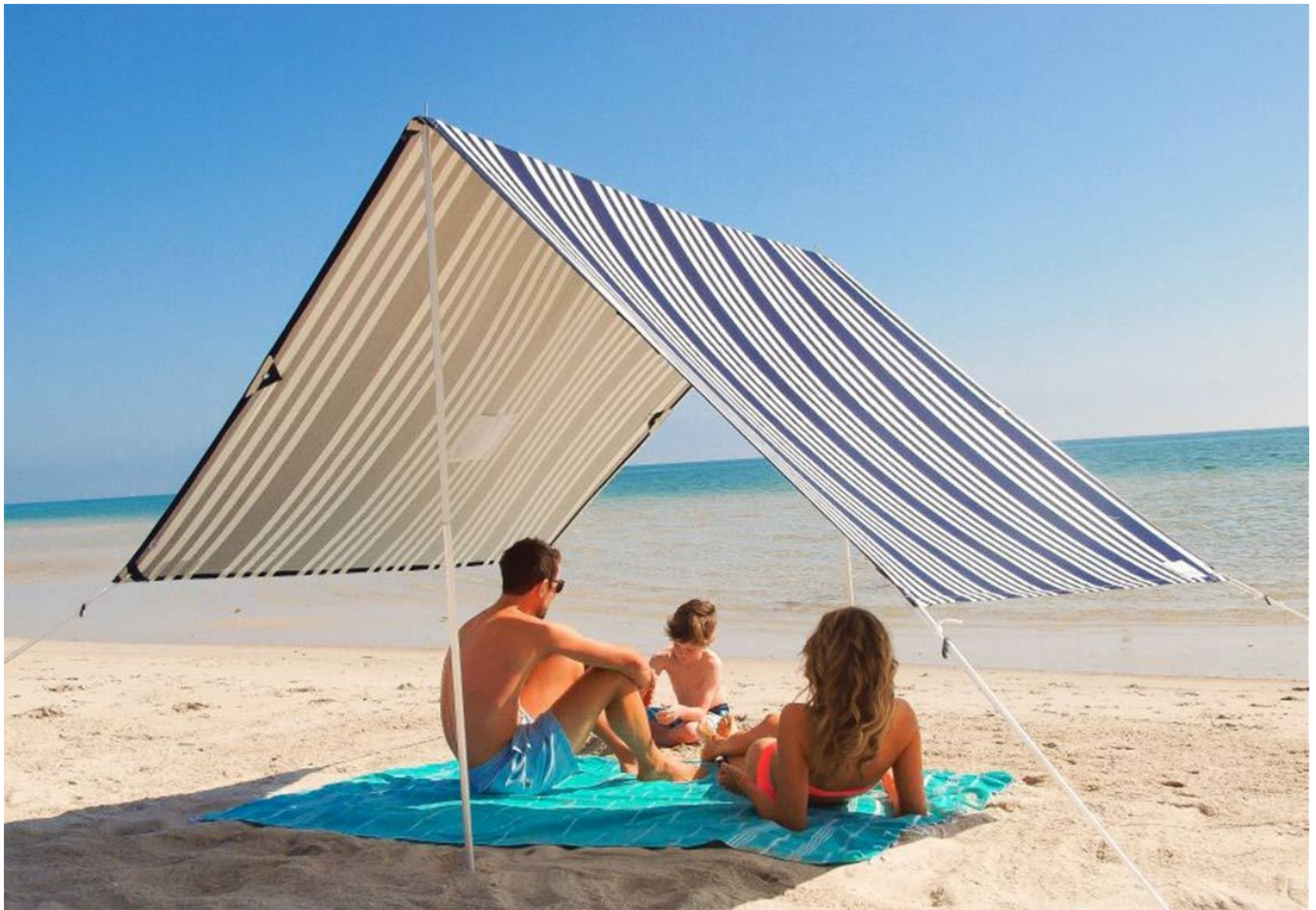
A beach shade is a must-have for staying cool and protected in summer.