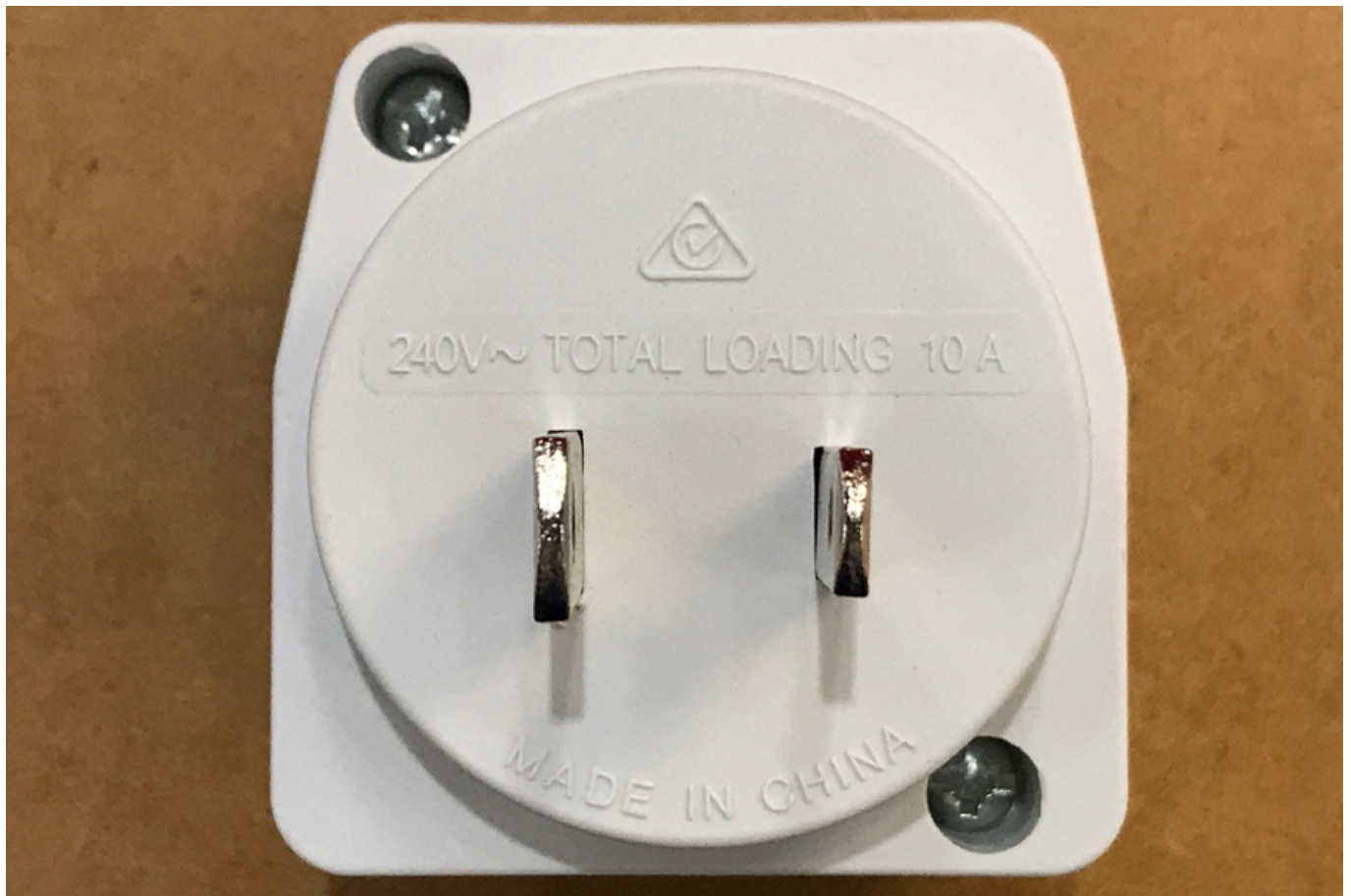
Travel Adaptor for UK, Hong Kong, Singapore...