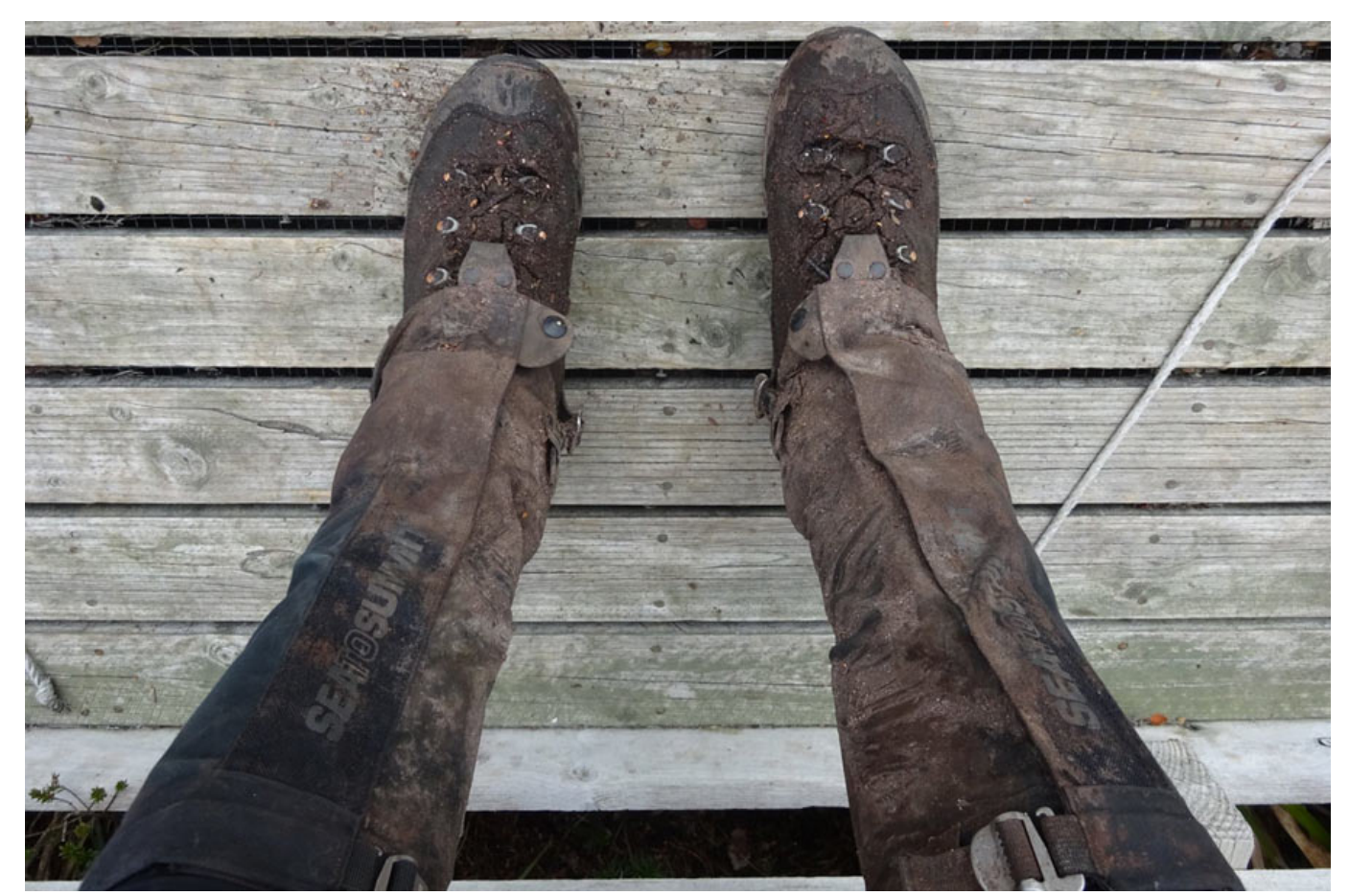
This is why you wear gaiters in Tasmania. Southwest National Park... The Overland Track. Mud is the rule, not the exception.