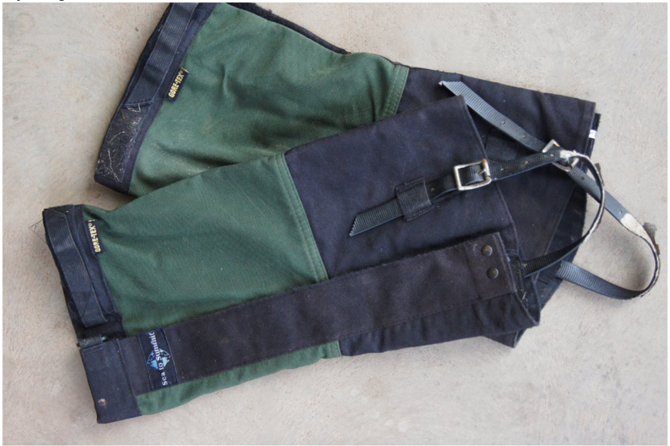
They've been snazzed up a bit in recent years. These are Sea to Summit Quagmires circa afew-years-ago. Holding up well, don't you think?

The straps are the obvious wear points but the hard-wearing material just keeps on going. If I do wear the straps out there are replacement ones available that can be easily fitted. The new bushwalking season in Australia is fast approaching. Time to add another season to my Quagmires!