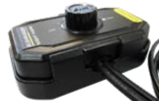
Leads orientated straight out

The Brightness Control Module incorporates a pivoting lead design which provides versatile mounting options. The leads can be orientated straight out of the control module or pivoted 90 degrees to hide them when flush mounting to a surface.