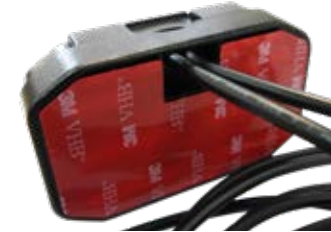
Leads pivoted 90 degrees