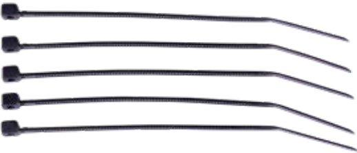
5 x Cable Ties