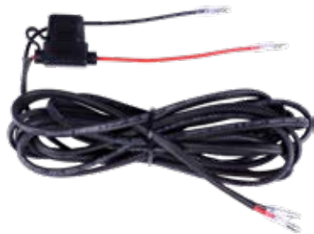
1 x 4-Way Distribution Lead