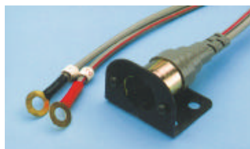
12 Volt Panel - APAN/ASPAN/BPAN