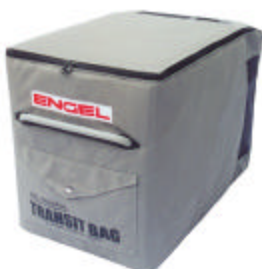
Transit Bag - TBAG17G