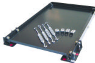
Fridge Slide - 515SLIDE