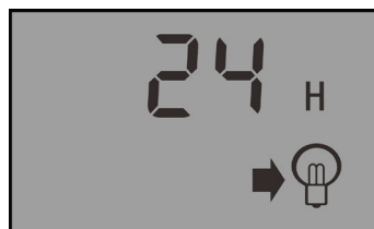
⑤ load timer