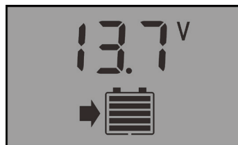
② float voltage