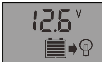
③ load reconnect voltage