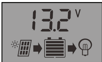
① main display