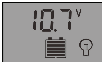
④ load disconnect voltage

Press ● FUNC to cycle through the 6 menu options.