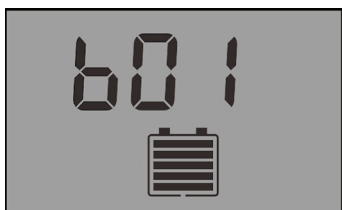
⑥ battery type