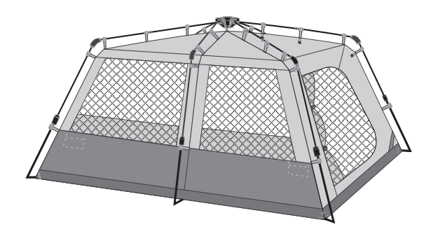
Tent without rainfly