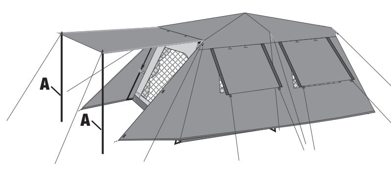
Complete tent with fly