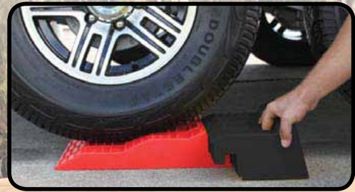
Re-attach the end piece of the leveller