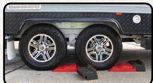
Removing the end allows the leveller to be placed between the wheels