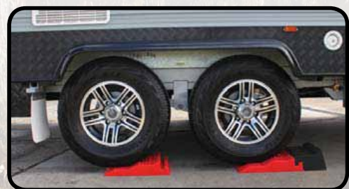
Position the vehicle on the first section of the leveller