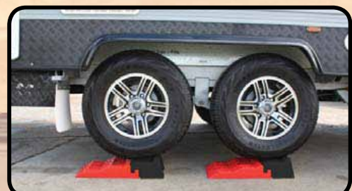
With the end piece re-attached the van can be raised by a full 100mm

The CVL2 leveller has a capacity of five tonnes to cater for even the largest RVs and can raise a wheel 100mm without jacking. It has been designed with off-road caravans in mind as it can cater for tyre widths up to 250mm where most levelling systems are limited to 200mm tyre width. The levellers are lightweight, being only 1.8kg each, and nest for easy storage into a space of 140mm x 570mm x 250mm. Supplied as a pair. Explore also has single axle levellers, leveller chocks and anti sink plates.