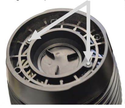
Fig 2. Lamp with lamp grip